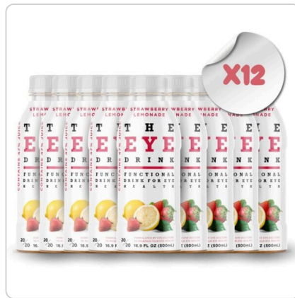
12-pack (subscription & retail)