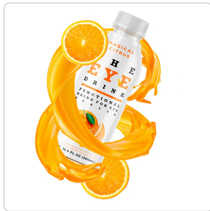
The Eye Drink — 16.9 fl oz (500 mL)