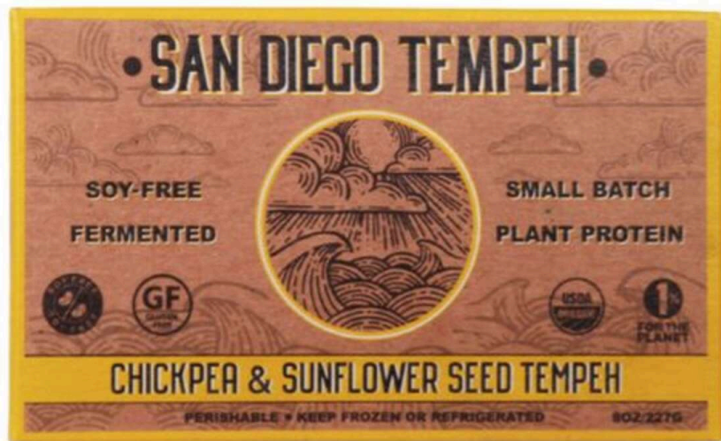
Chickpea & Sunflower Seed Tempeh