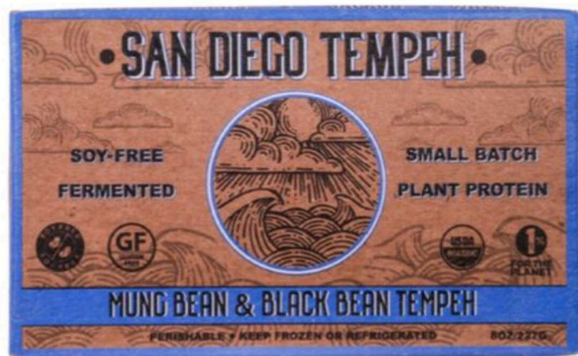
Black & Mung Bean Tempeh