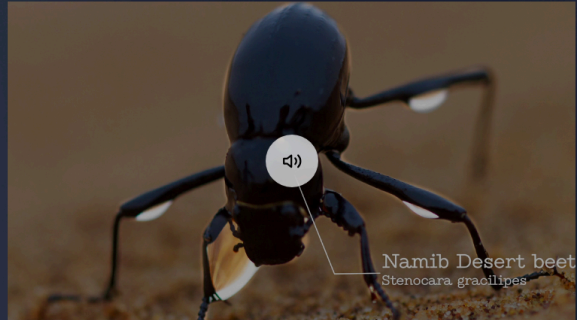
Namib Desert beetle Stenocara gracillipes

This Reg CF offering is made available through StartEngine Primary, LLC, a member of FINRA/SIPC. This investment is speculative, illiquid, and involves a high degree of risk, including the possible loss of your entire investment.