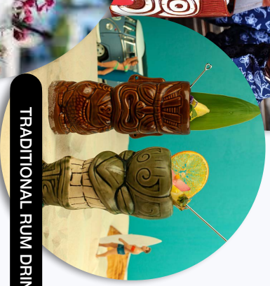
TRADITIONAL RUM DRINKS