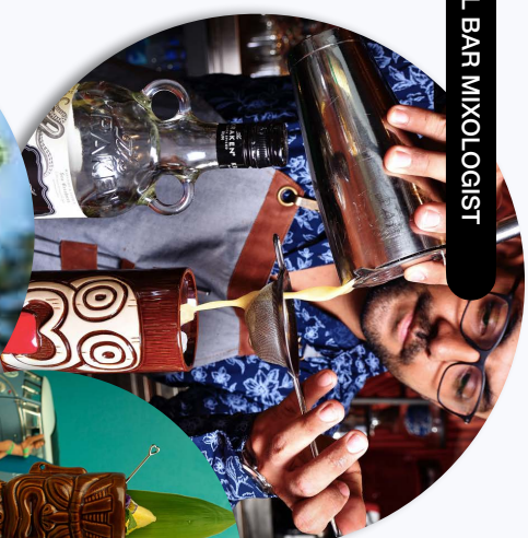
FULL BAR MIXOLOGIST