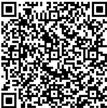
(Please scan and register请扫码注册)