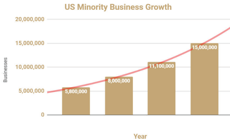
Figure 1: Minority Business Growth

The number of minority-owned businesses in the United States has grown exponentially over the last decade and is predicted to continue this growth in the decades ahead. As of 2007, there were 5.8 million businesses, growing to 8 million in 2012 to 11.1 million in 2017. 5 These are increases of 38% and 39% respectively. By 2022, it is estimated that the number will increase by another 36% to 15 million minority-owned business in the United States. The trends driving growth in our market are population growth, economic growth, and immigration.