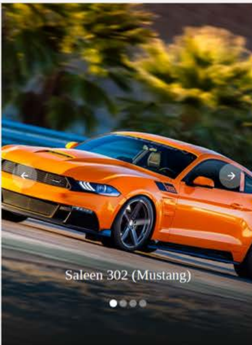
Saleen 302 (Mustang)