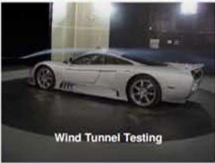
Wind Tunnel Testing