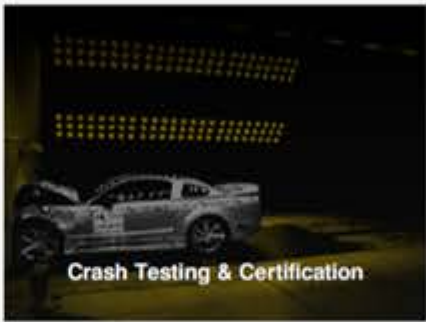
Crash Testing & Certification