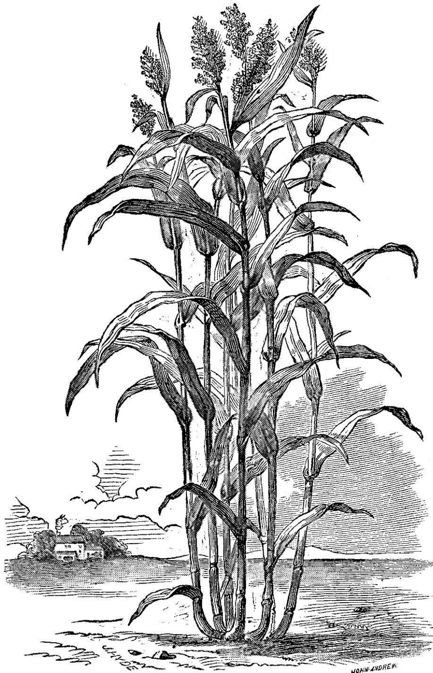
THE CHINESE SUGAR-CANE.